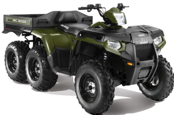
Polaris Big Boss